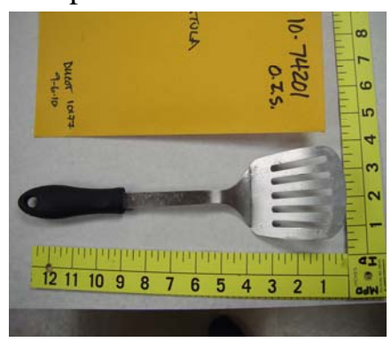
Flat portion visible